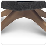
L21 Timber Swivel Base - Oak Stain