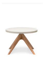
Delphi Coffee Table