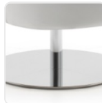
D9 Disc Swivel Base (Special Order option, extended lead time)