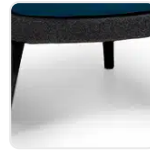
L25 Timber Base - Custom Black Stain