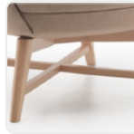
L30 Timber Cross Base - Oak Stain