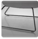
S7 Sled Base - Black Powdercoat