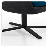
R13 Black 4 Way Swivel Base