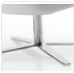
R13 Polished 4 Way Swivel Base