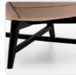
L30 Timber Cross Base - Custom Black Stain