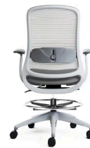
Savi Drafting - White Grey