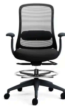
Savi Drafting - Black