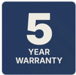
5 Year Warranty