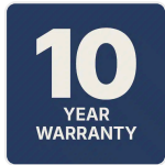
10 Year Warranty