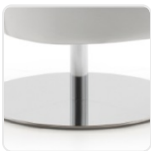
D9 Disc Swivel Base (Special Order option, extended lead time)