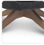
L21 Timber Swivel Base - Oak Stain