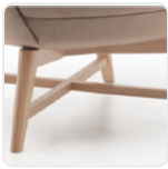
L30 Timber Cross Base - Oak Stain