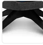
L21 Timber Swivel Base - Custom Black Stain