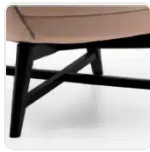
L30 Timber Cross Base - Custom Black Stain