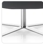
R13 Polished 4 Way Swivel Base