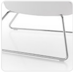
S7 Sled Base - Chrome