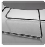
S7 Sled Base - Black Powdercoat