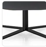
R13 Black Powdercoat 4 Way Swivel Base